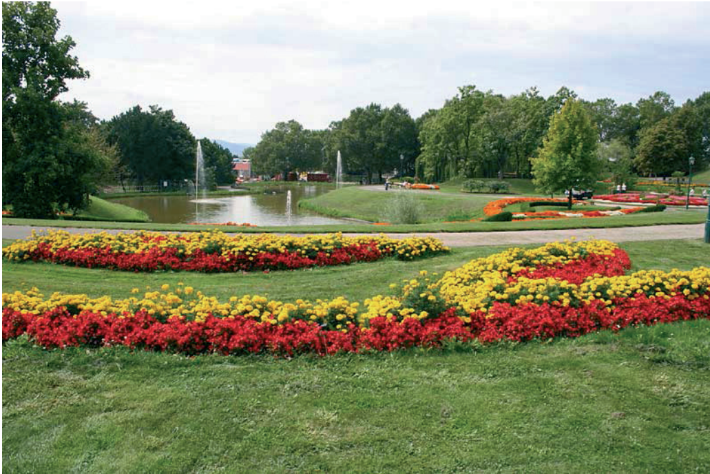
Fig. 1: Example of an intensively used 'Baroque' garden (Laaer Berg) – Photo: G. Mitter.